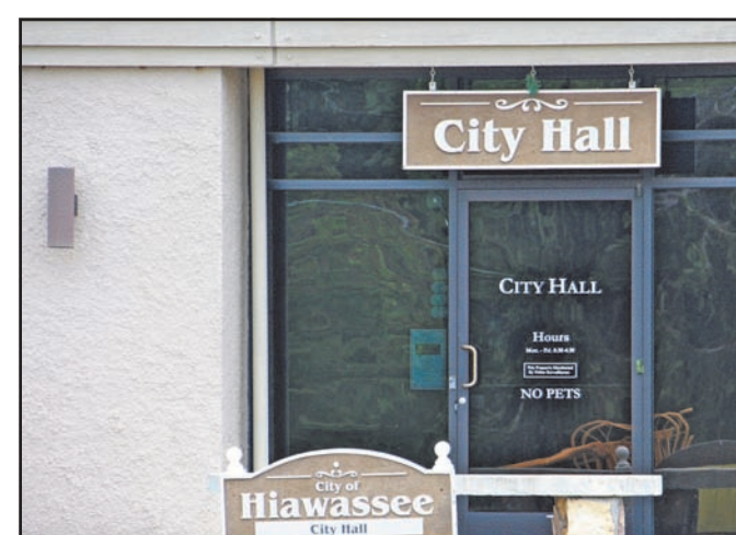
Hiawassee City Hall