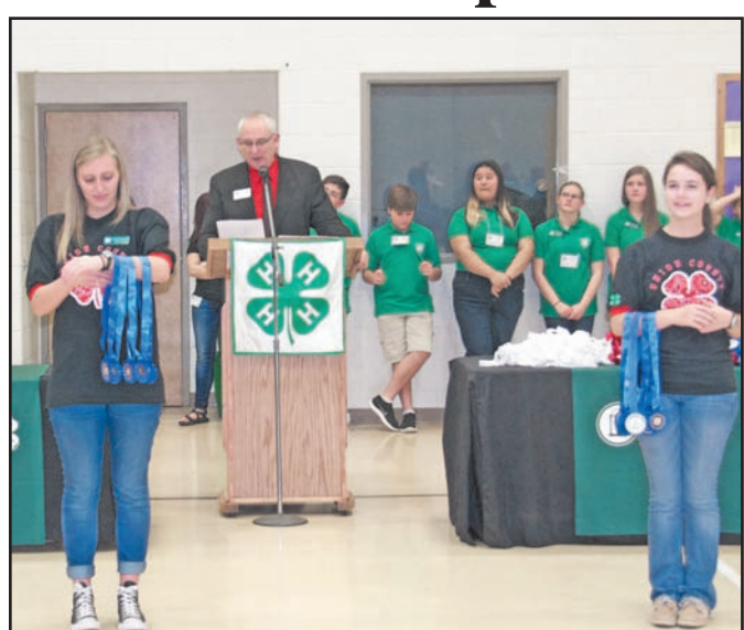
The awarding of ribbons inside the Union County Middle School gym.

According to the Georgia 4-H website, project